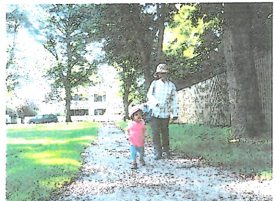
【My granddaughter and I taking a walk】