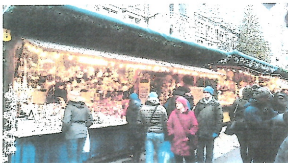
【Christmas Market in Munich】