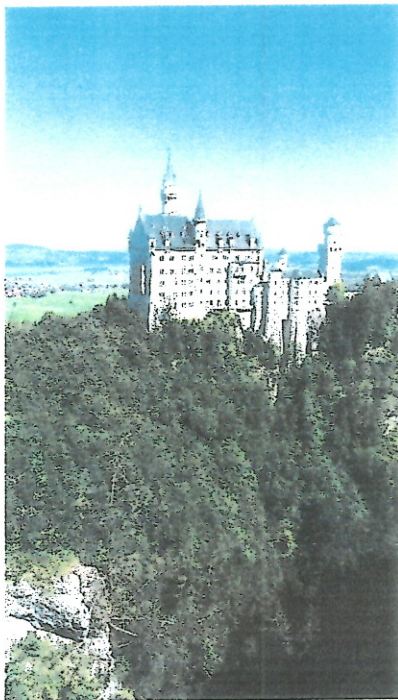
【Neuschwanstein Castle on the mountain】